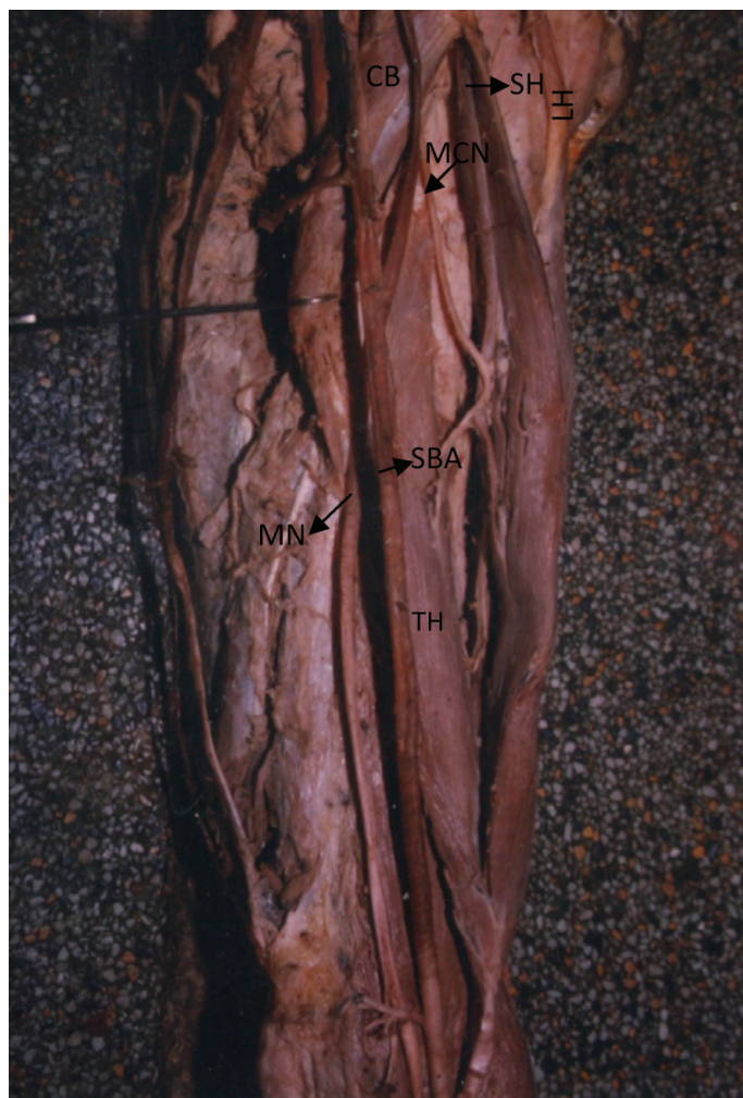
[Table/Fig-1]: Showing the Third Head Of Biceps Brachii and Superficial Brachial Artery In Right Left Upper Limb

(CB: Coracobrachialis; LH: Long head of Biceps Brachii; SH: Short head of Biceps Brachii; TH: Third head of Biceps Brachii; MCN: Musculocutaneous nerve; MN: Median nerve; SBA: Superficial brachial artery)