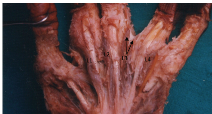
[Table/Fig-3]: Showing Bifurcation of Third Lumbrical (L1- L4: Lumbricals)

(FDS- Flexor digitorum superficialis; FDP- Flexor digitorum profundus; FPL- Flexor pollicis longus; AMI: accessory muscular slip for FDP; AMII: accessory muscular slip for FPL; BR: Brachioradialis; T1, T2: Two tendons of insertion of BR; MN: Median nerve; RA: Radial artery; UA: Ulnar artery)